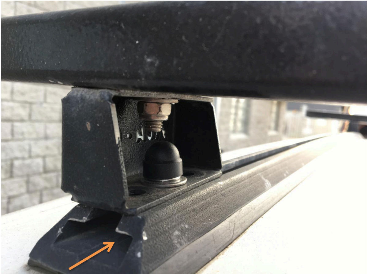
Figure 1: Roof Rail Tract which the Square Nut is inserted into