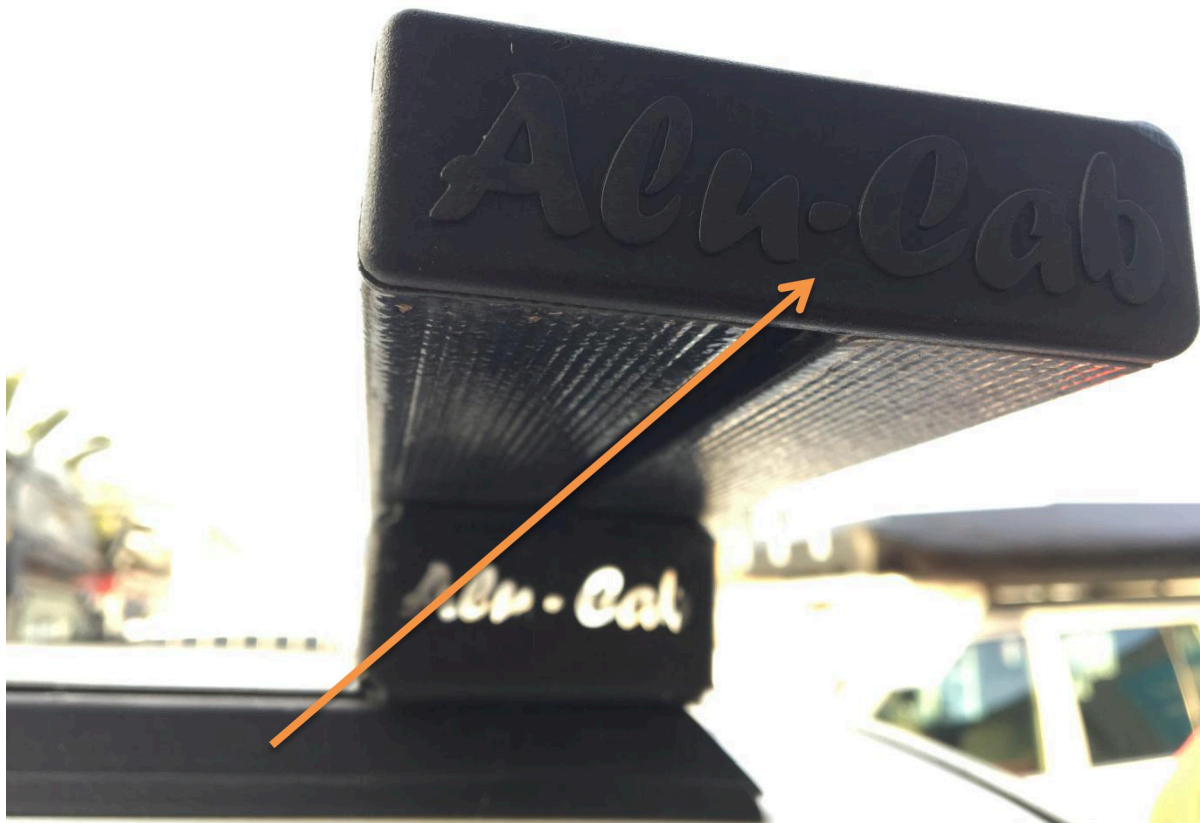
Figure 3: Load Bar End Cap

We now need to mount our Load Bars to the Mounting Brackets. Our first step here is to remove the Load Bar End Caps. We can then insert an M8 Hex Bolt into the Nut Slot of the Load Bar. We can now position and place the Load Bar and Hex Nut over our Mounting Bracket and fasten it down using a Flat Washer and Nyloc Nut. Once fastened, you can fit the End Caps Back onto the Load Bar. The following Images will demonstrate this process: