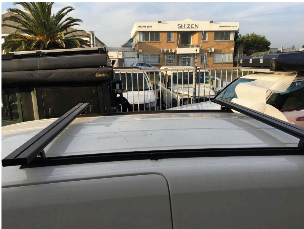
Figure 10: Double Load Bars Installed on Vehicle