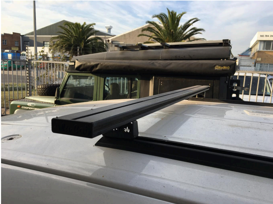
Figure 9: Front Load Bar Installed