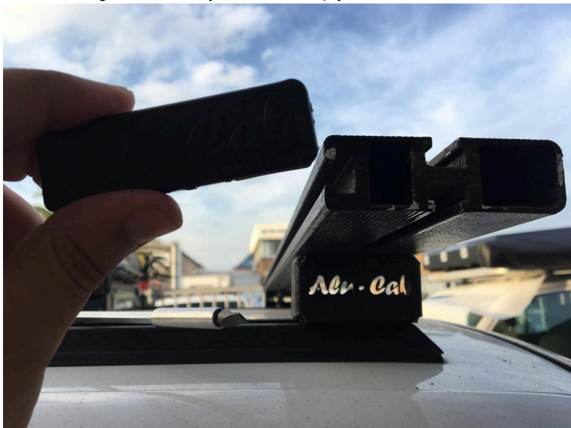
Figure 5: Remove the End Cap once loose