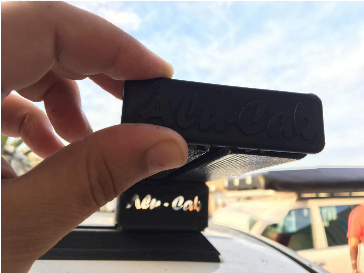
Figure 4: You may need a tool to pry it off of the Load Bar