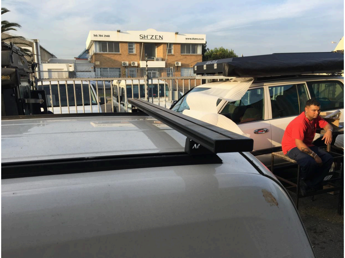
Figure 8: Rear Load Bar Installed

Depending on how many Load Bars you are using for your application and vehicle, repeat the Fitment steps for the other Load Bars you are installing.