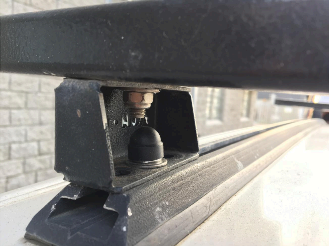
Figure 7: Fastened Load Bar to Mounting Bracket